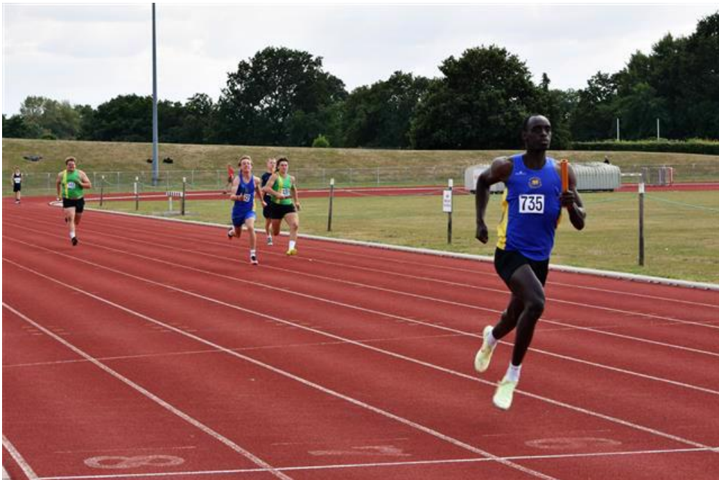
Team Bath teamwork in action during the relay at the Avon League

Happy Bank Holiday Pluggers. Hopefully you've been enjoying an action-packed long weekend, in the never-ending summer weather, in our great outdoors, doing something fun, somewhere nice. Whatever your fancy, we've surely got something to tickle your tastebuds in this week's edition. From track & field to local relays, to a World Champs Aquabike, to a Parkrun Champs update. Yum, yum. Tuck in!