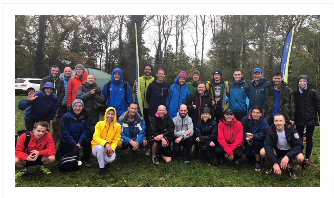
TBAC XL'ing as the XC season KOs