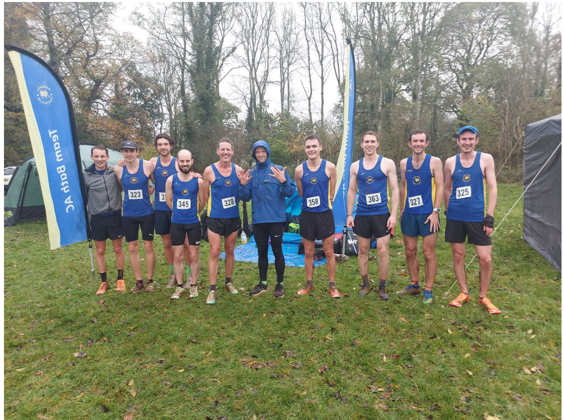
GlosAAA Cross Country League 2022-23 R1 5th November