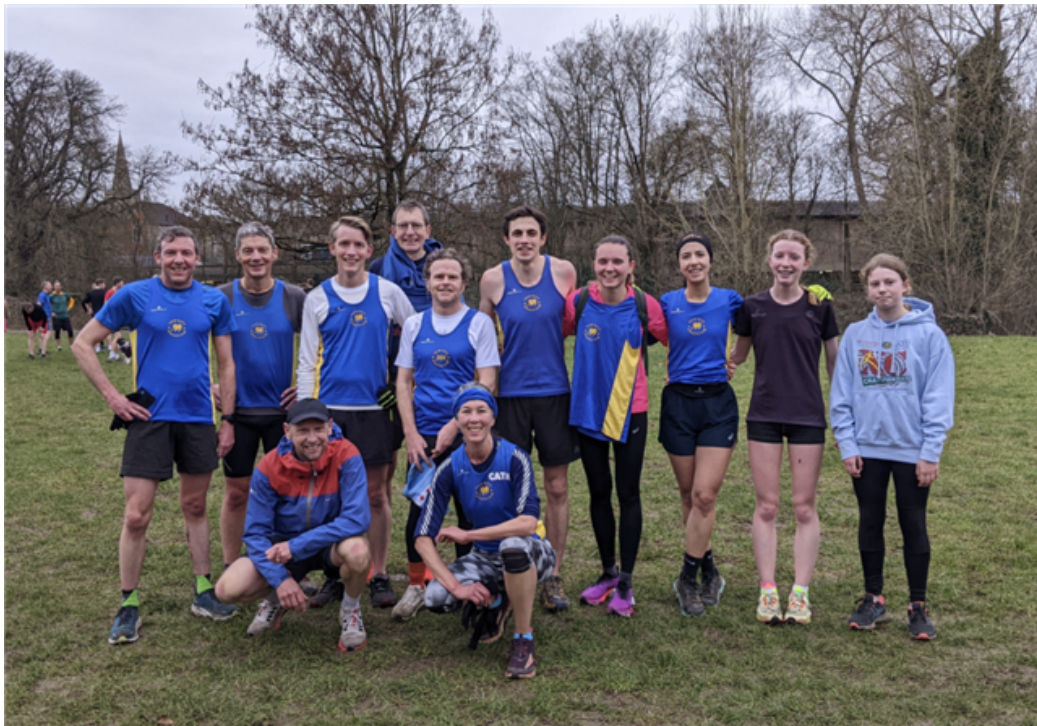
Feeling chipper in Chippenham after TBAC's Parkrun takeover