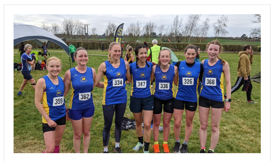
Triumphant TBAC, led by our Ladies!

It seems that TBAC enjoyed its own Super-Sunday last weekend, with results coming in so thick and fast I could smell the cogs burning in my vidiprinter. From XC, to road racing, to multi-sport, to multi-terrain - brilliant performances across the board. So get stuck in!