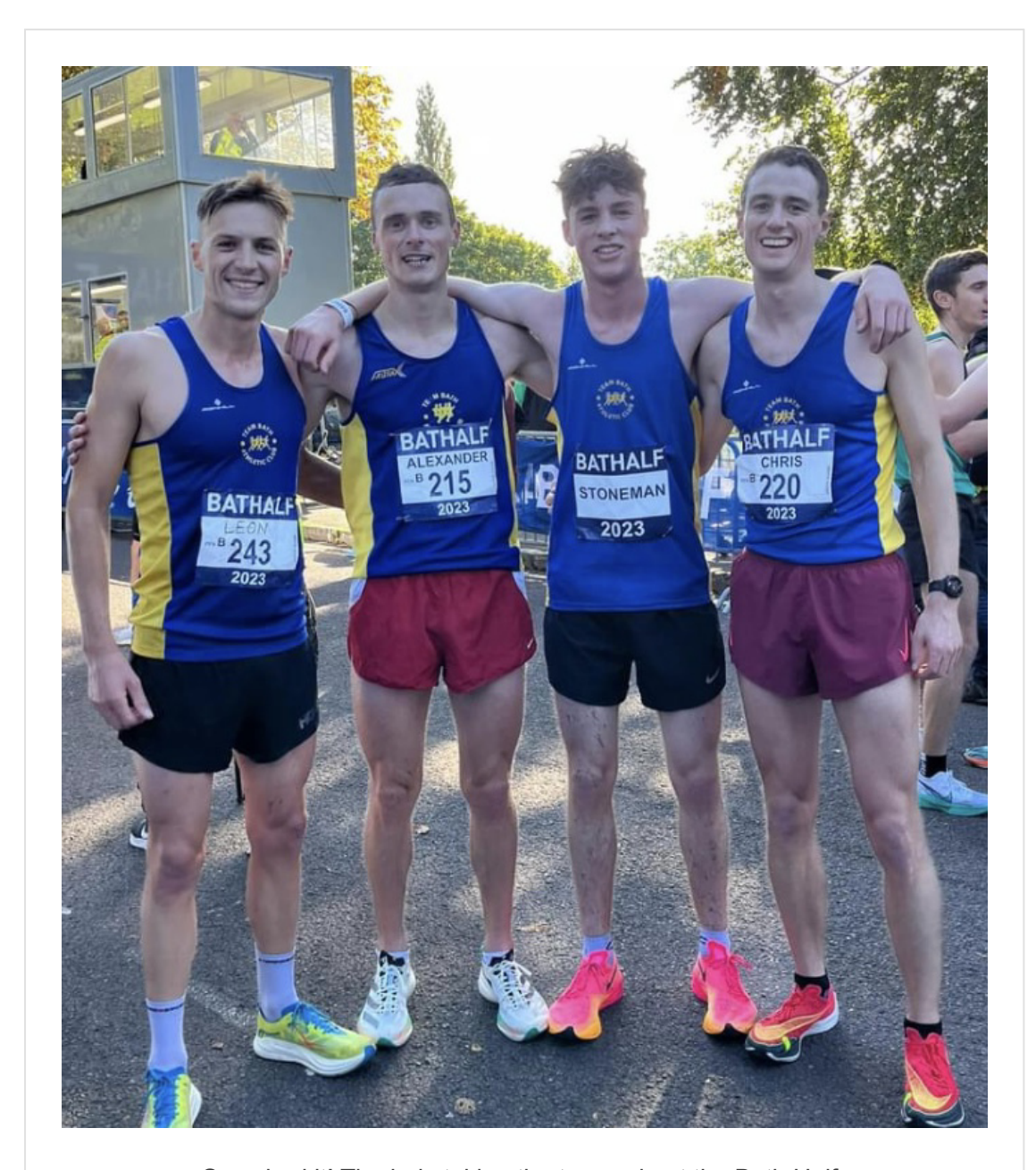
Smashed it! The lads taking the team win at the Bath Half.

What a Bath Half! The Club turned out in force to enjoy perfect conditions, many rewarded with super-fast times and PBs galore. So we dedicate this issue to the race, with a couple of additional cracking performances by Tom and Ilana to wrap things up.