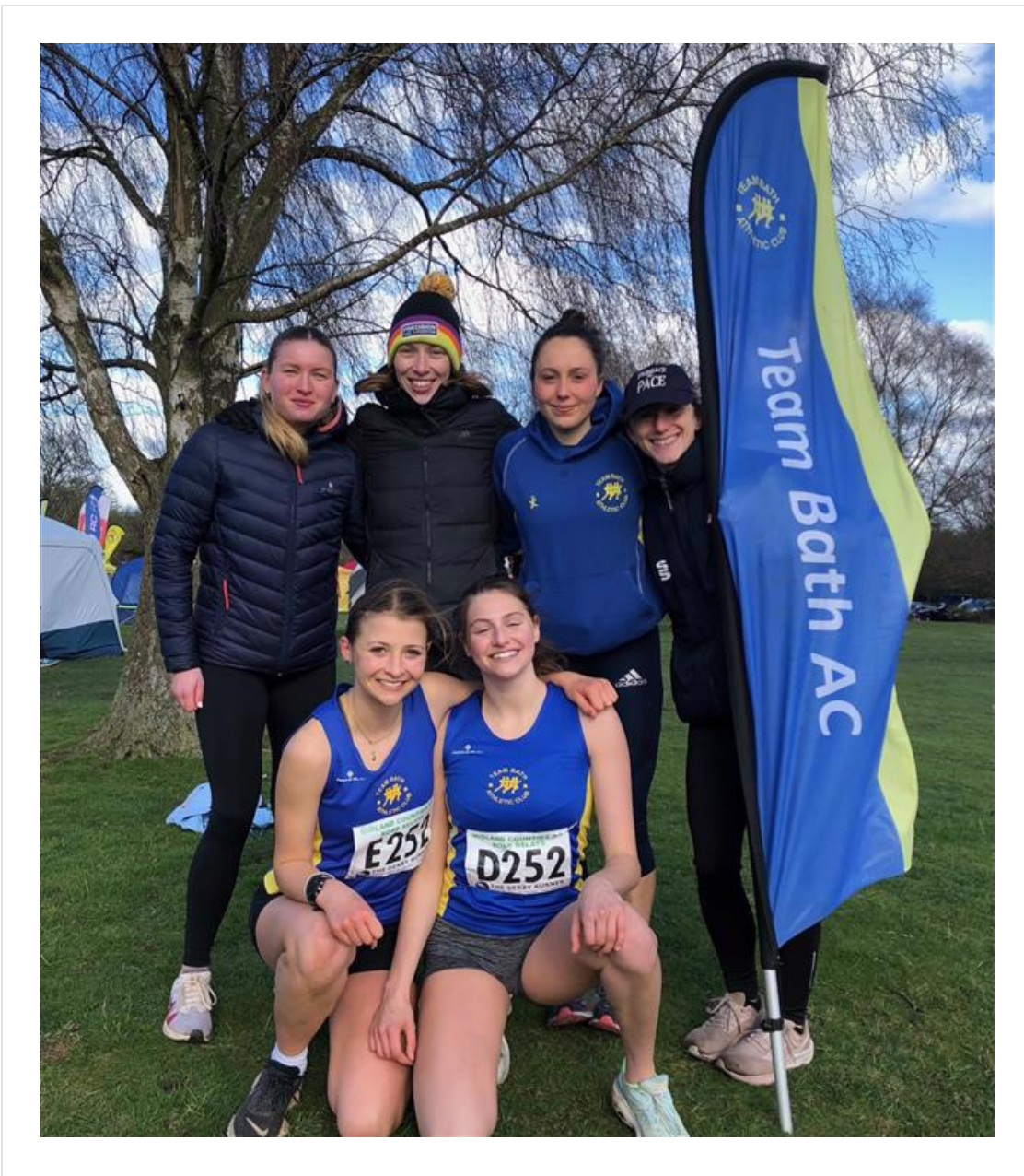
TBAC Women dominant at Sutton Park

Squeezing in a short Plug just in time, before we reveal today's result at the National Road Relays. The Men, and especially the Women, had super-strong runs at the Midland Road Relays last month, showcasing the exciting momentum in our TBAC teams right now.