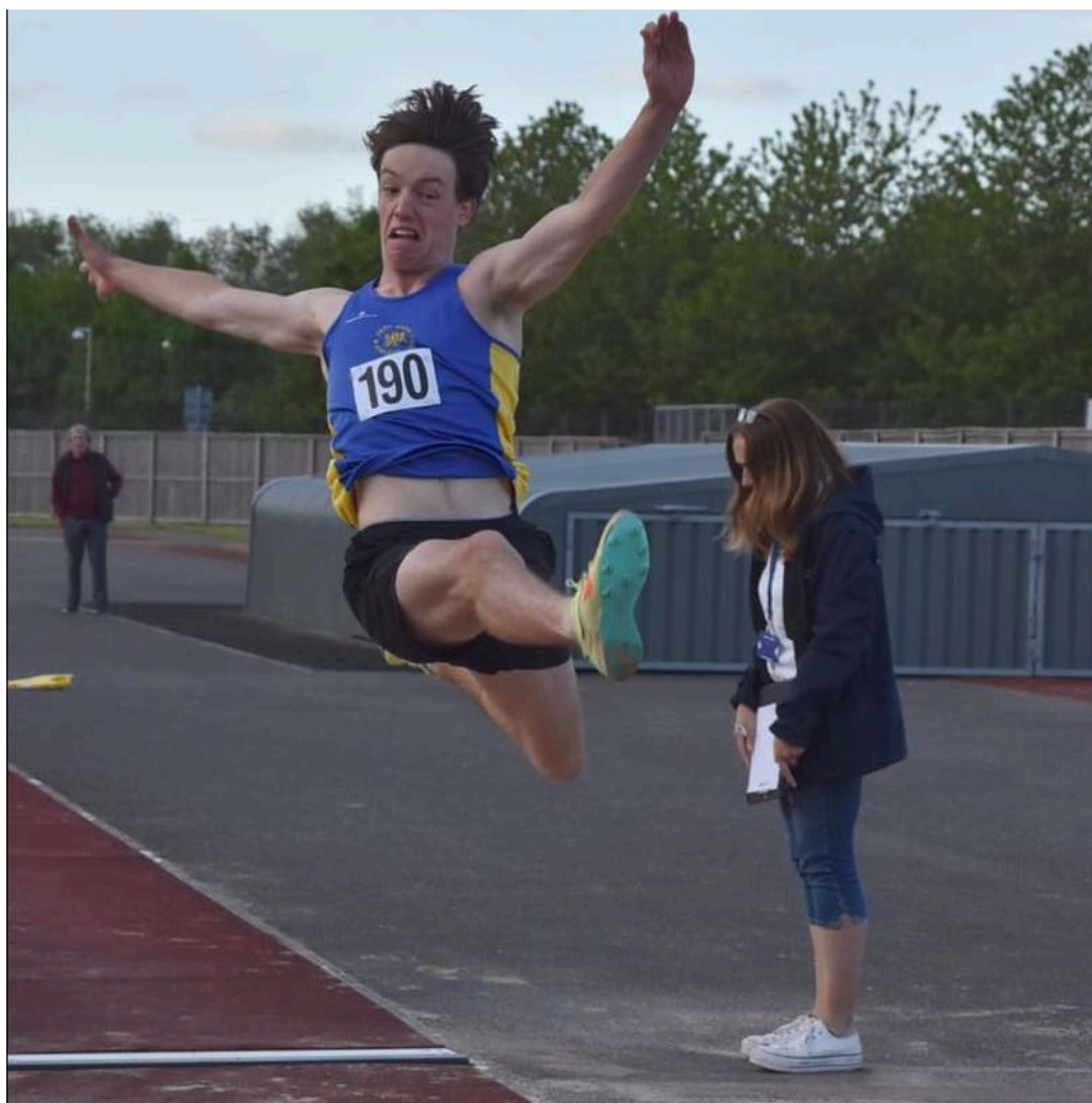
Flying at the Midland Counties Champs