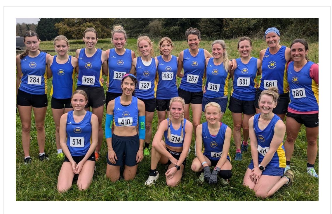
TBAC Women tearing it up at R2 in the XC League

Three weeks of results in this bumper edition. So get your slippers on, grab a hot drink, maybe a hot water bottle (whatever it takes to stay warm), and curl up on the sofa (or get under the duvet!) with your favourite regular read, the TBAC Plug!